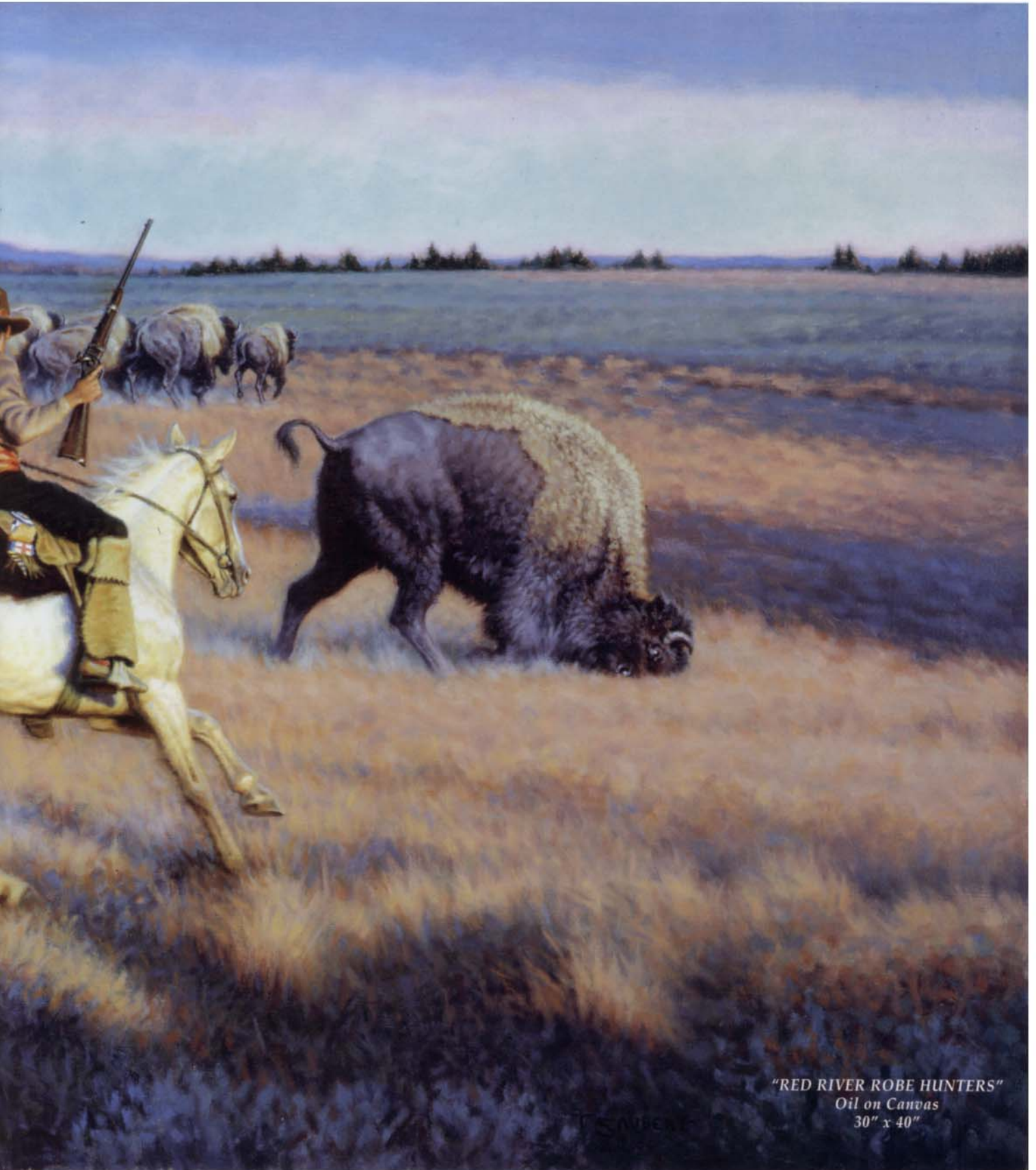
"RED RIVER ROBE HUNTERS" Oil on Canvas 30" x 40"