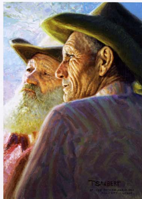
"BUCKING HORSE SALE" Oil on Canvas 18" x 14"

Mountain Trails Gallery - Jackson Hole, Wyoming Montana Trails Gallery, Bozeman, Montana