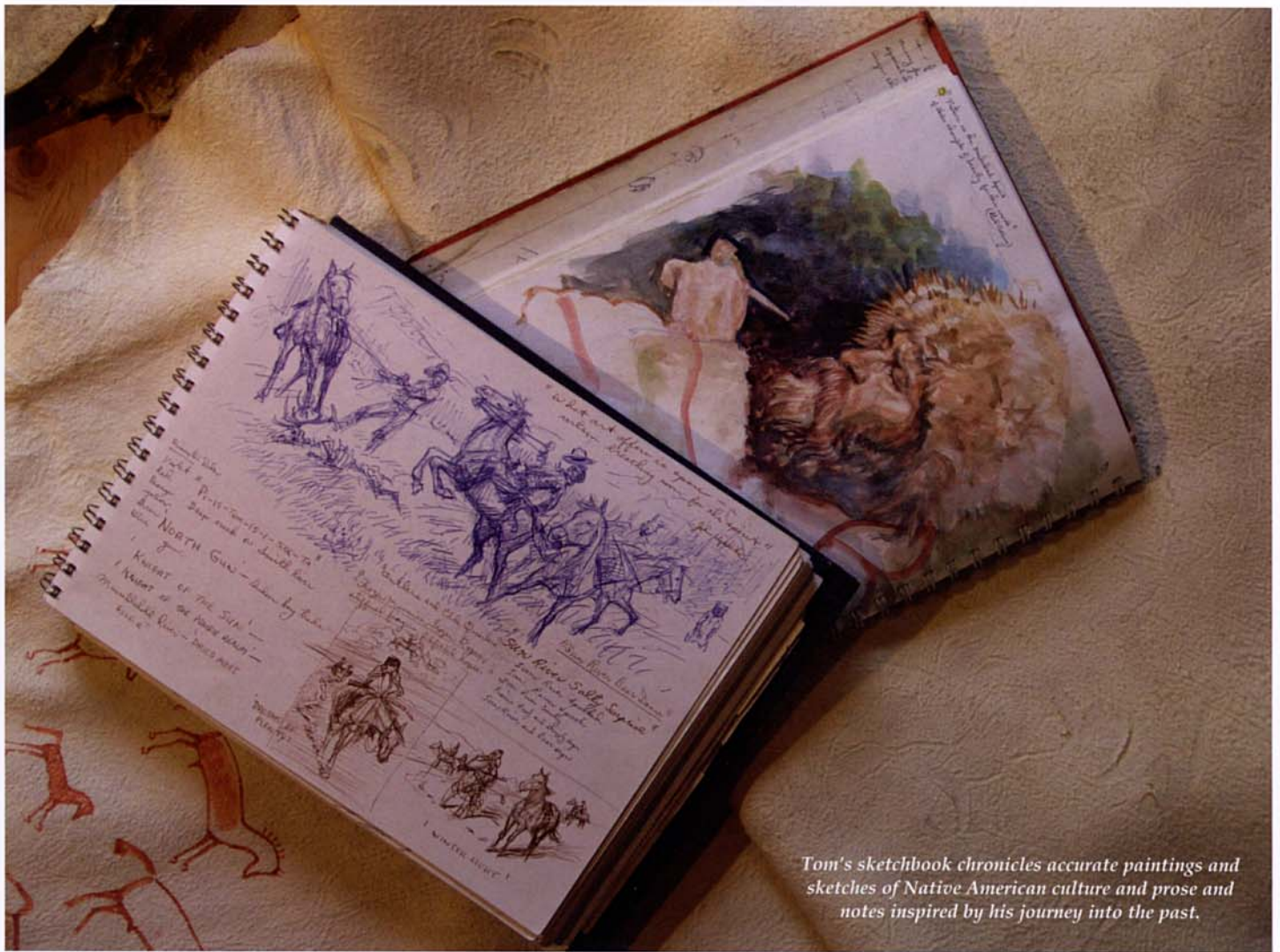
Tom's sketchbook chronicles accurate paintings and sketches of Native American culture and prose and notes inspired by his journey into the past.

In spite of a myriad of fascinating objects that brim walls and shelves, my eyes are pulled to the easel and a painting in process. It has all the aspects that make a Saubert painting so wonderful - bloated clouds rest on the snowy Rocky Mountain landscape where a Metis Indian stands with a dignified air in front of a Red River cart. The light and shadows are perfectly rendered so you can practically smell the snow and the moist air on your face. But the landscape simply sets the scene for the powerful figure who gazes over his shoulder, softly lit by a filtered sunlight. As I leave the studio I look over my shoulder to take one more look at this deerskin clad Native who has taken on life in Tom Saubert's painting. Even though silent - he speaks of Montana's past. L