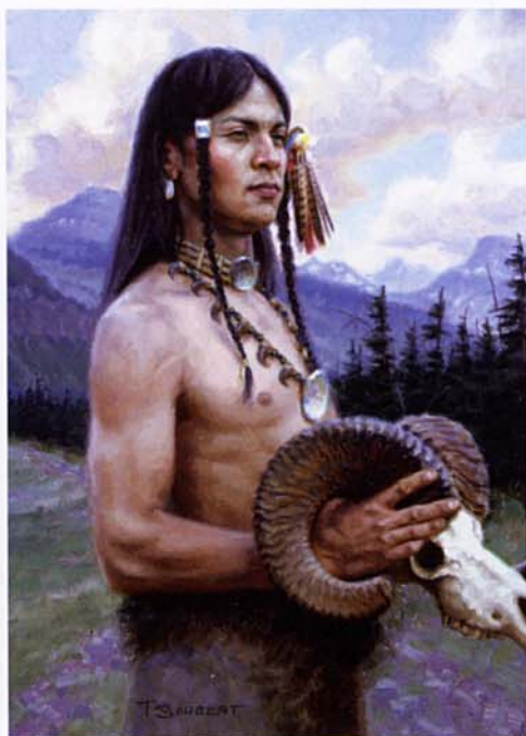
"KUTENAI HUNTING EFFIGY" Oil on Canvas 12" x 9"