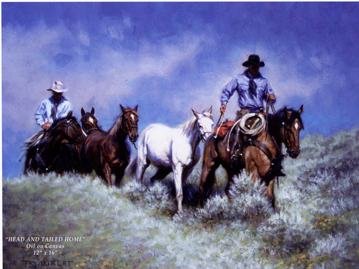
"HEAD AND TAILED HOME" Oil on Canvas 12" x 16"